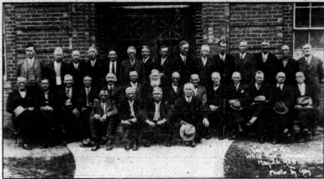
THE WHITE PINE REUNION, May 26, 1928